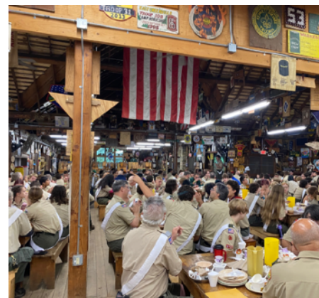
CLEARING THE RED TRAIL