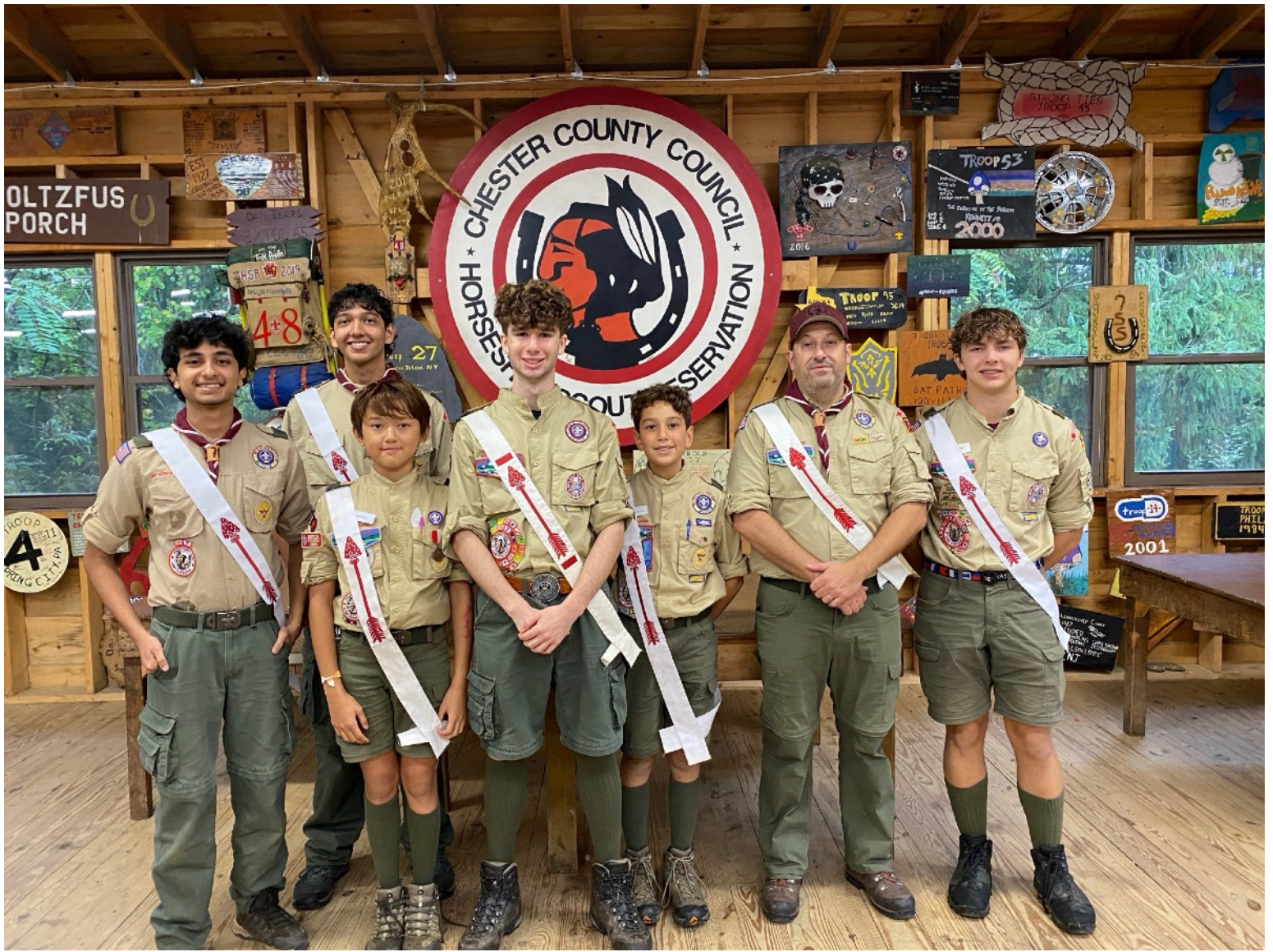
NEW ORDEAL AND BROTHERHOOD MEMBERS