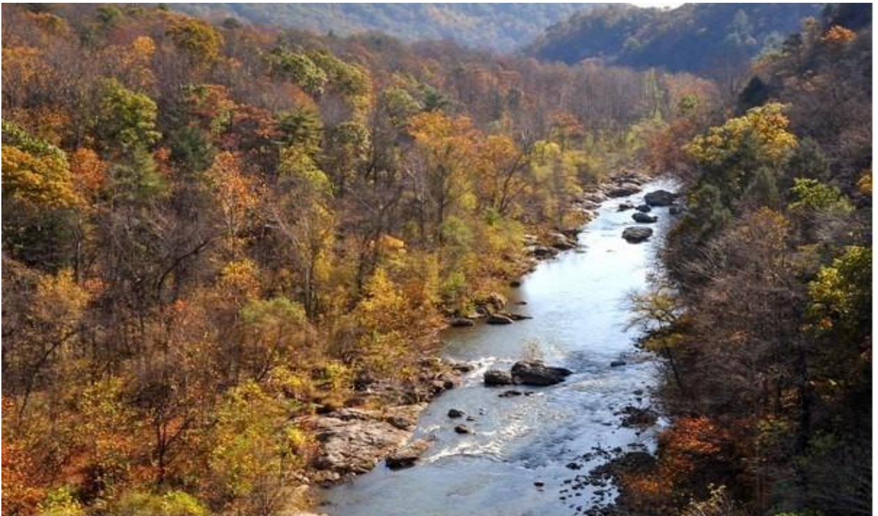
Roanoke River Gorge from the Blue Ridge Parkway

The Roanoke Chapter has lots of experience on this section so check with them on details.