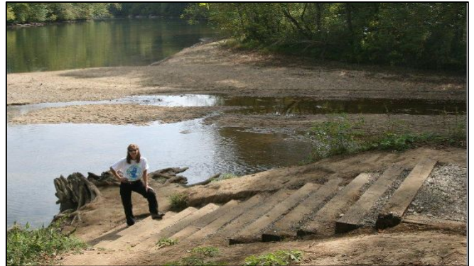
The take-out built by the Roanoke Float Fishermen.

The take-out is also the terminus of the Roanoke River Greenway, another fun location. And it's next to Explore Park as well. Finally, the take-out is also the confluence of Back Creek, another good float!