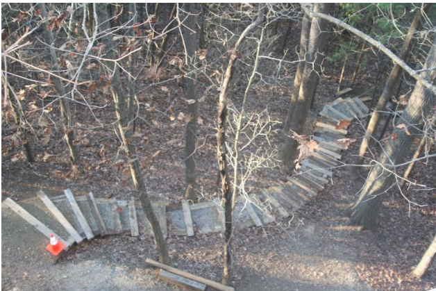
209 Steps to the river... but an easy slide for boats! And parking at the top on the Blue Ridge Parkway.