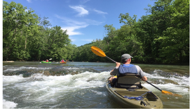
The take-out built by the Roanoke Float Fishermen.