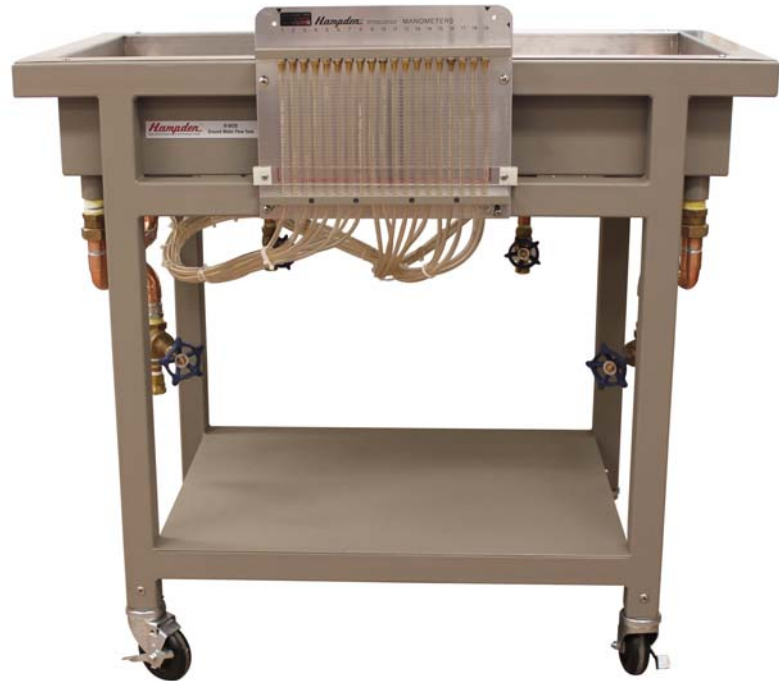
MODEL H-6526 Ground Water Flow Tank Dimensions: 42"H x 43¼"W x 25"D Weight: 500 lbs.

19-tube manometer connected to a mounting frame. The frame is silk-screened with horizontal lines in increments of 5 mm for reference along with a vertical scale of 150 mm in 1 mm steps. A sliding horizontal cursor provides immediate reference of any level. The other end of the tubes is connected to the pressure taps located in the tank bottom.