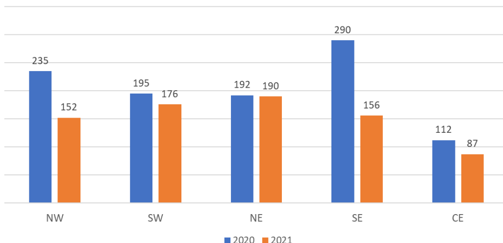
Larceny from Autos