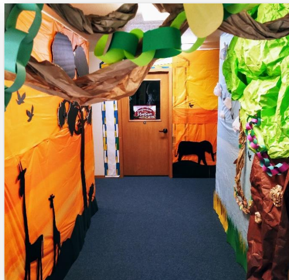
Ready to ROAR!

Sun. July 28 th , during both worship services