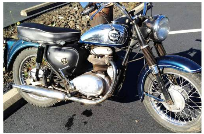
Terry Wolert's 1963 BSA 500cc