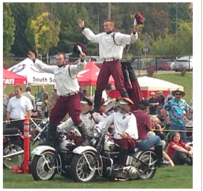
Seattle Cossacks Motorcycle Stunt Team (don't try this at home)