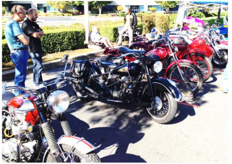
OTC Member Bikes on Display at Paradise Harley-Davidson, Tigard

Interested visitors signed up for more information about OTC. We also signed up a new member! Thanks to members who came out !