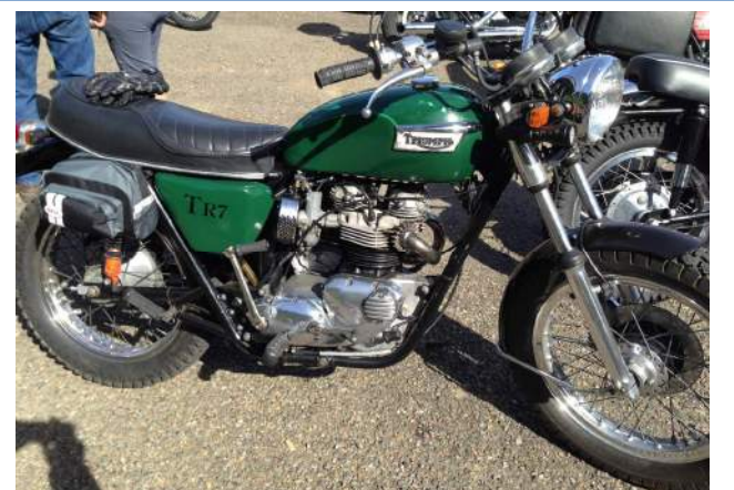
Spike Smith's Triumph Scrambler