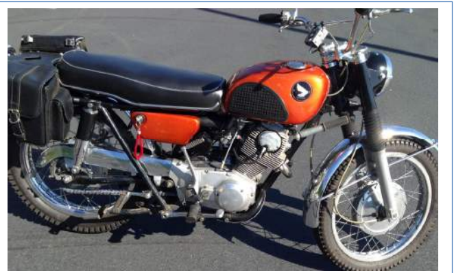
Stan Randall's 1967 Honda CL77, 305 cc