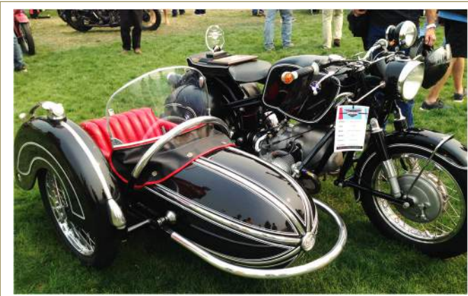
1969 BMW Steib S500 R69S owned by James Iwase