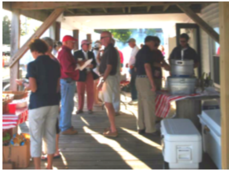
Post- and Pre-Race Party