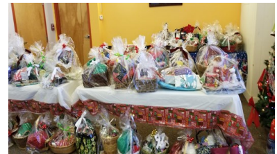
Baskets prepared in 2018

We need donations of small like-new household items, lotions, small decorations, etc. for the baskets. Bring them on Wednesday or drop them on my front porch anytime before Wednesday evening. Like-new Christmas decorations are welcome to give the baskets a holiday flare. — Diana Langlois