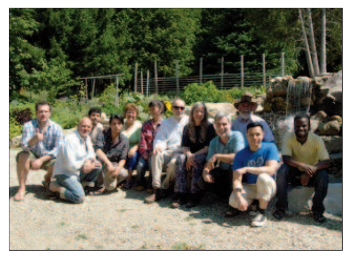
FIGU PASSIVE MEMBERS