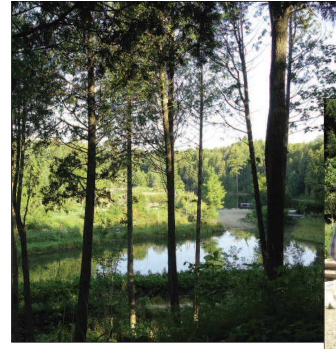
PEACEFUL AND BEAUTIFUL SCENERY