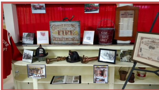
Thanks to Dale Franzen and the Gothenburg Volunteer Firemen for sharing department memorabilia. Display included archive pictures from the museum files.