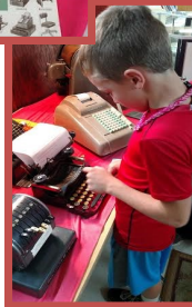
Compact folding typewriter from Judy & Cal Frey. Other office machines were on display including a mimeograph copier, adding machines & microscopes.