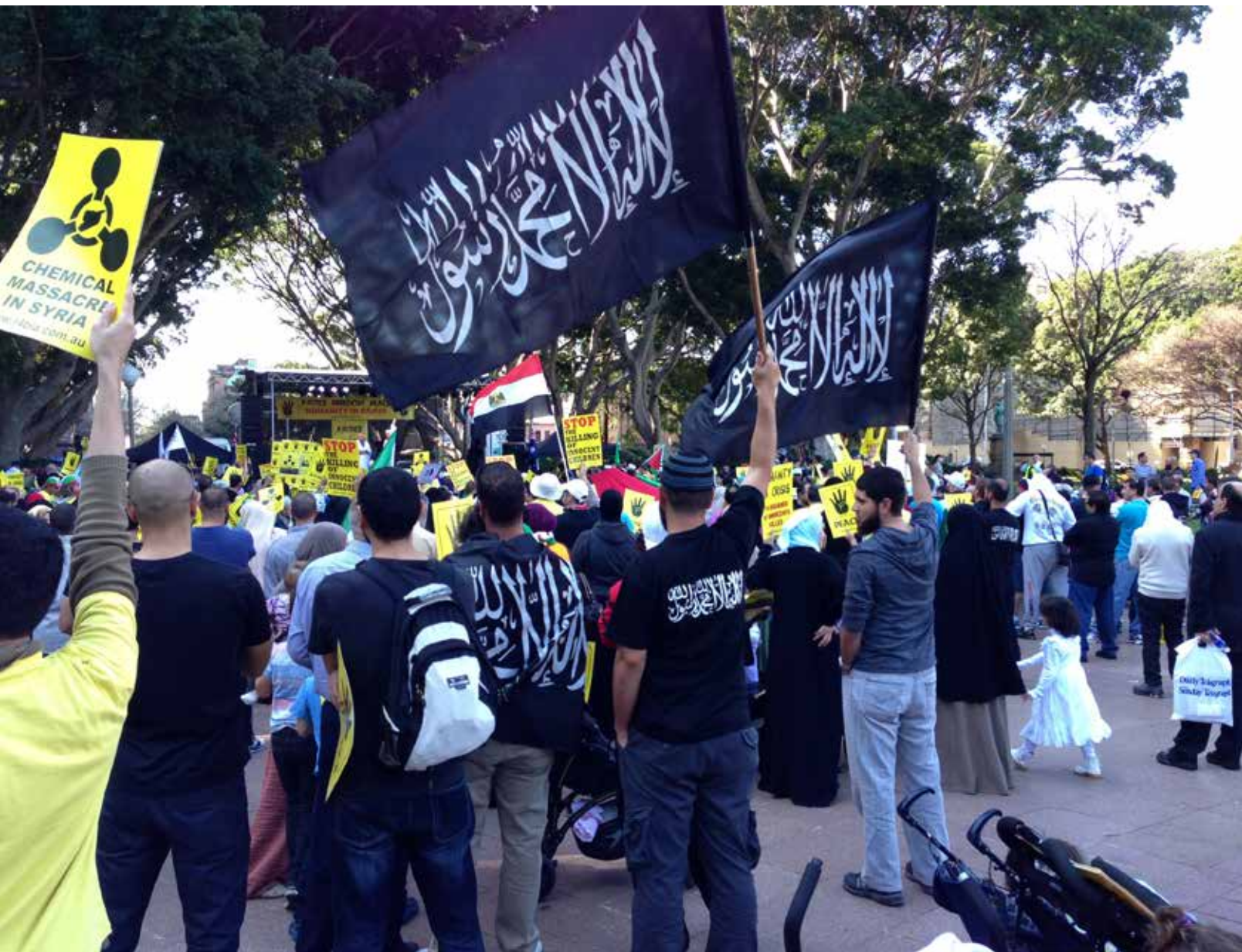
Pro-Muslim Brotherhood Rally, Sydney, Australia, 1 September 2013

Muhammed's example, these groups claim persecution and preach "tolerance" until they have sufficient infrastructure and military strength to ensure a victory. We can see this at work in the Arab Spring movement and the rise of ISIS, for example. Other topics discussed included the development of the Qur'an, how