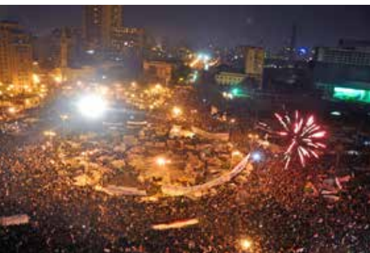
"Arab Spring" in Tahrir Square.