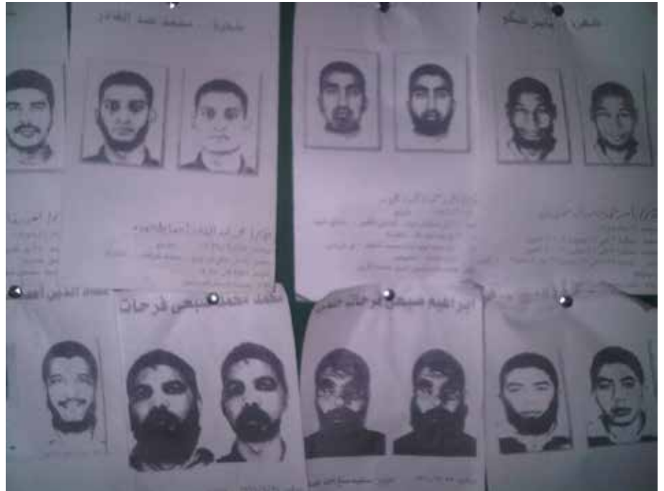
The most wanted suspects and terrorists by Egyptian police and national security department as being armed militias of the Muslim Brotherhood in Suez canal.

and implementation of shariah in each of these countries throughout history. This led to an examination of key Muslim Brotherhood documents captured in counter terrorism raids conducted against various leaders starting after September 11th, 2001. The captured documents outline the Brotherhood's strategy of "Civilization Jihad" and the methods advocated for use in penetrating educational, legal, and political systems, government offices, intelligence apparatuses, media, and