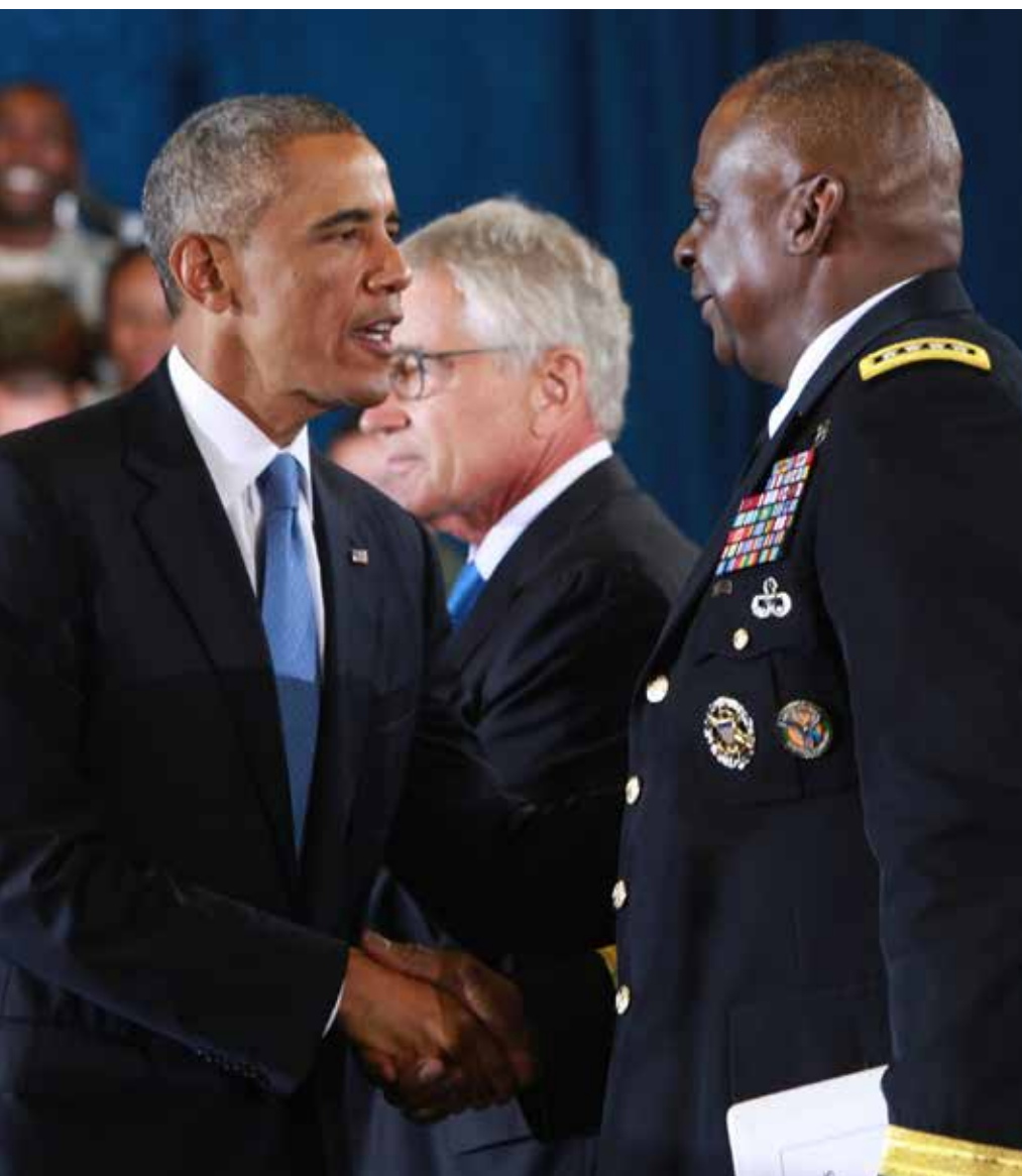
President Barack Obama is greeted by U.S. Central Command Commander, Army Gen. Lloyd J. Austin III.

how the weight of deciding to conduct an armed revolution weighed on the founders. The founders also understood that freedoms could not be extended to those who would seek to destroy it. The night concluded with an enlightening comparison of the U.S. Constitution, the Iranian Constitution, and shariah law.