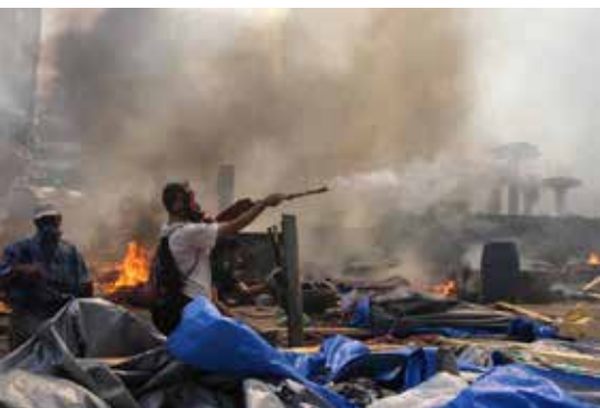
A supporter of the Muslim Brotherhood and Egypt's ousted president Mohamed Morsi fires fireworks towards police during clashes in Cairo on August 14, 2013, as security forces backed by bulldozers moved in on two huge pro-Morsi protest camps, launching a long-threatened crackdown that left dozens dead. The clearance operation began shortly after dawn when security forces surrounded the sprawling Rabaa al-Adawiya camp in east Cairo.