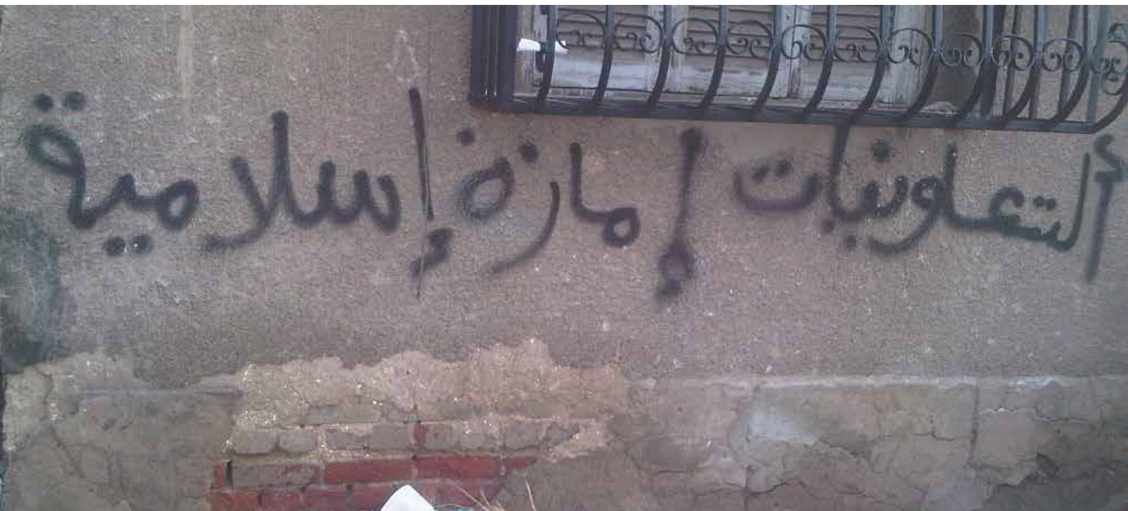
Muslim Brotherhood graphics.

the military in order to subvert these systems to further the implementation of Islamic law in the United States. These documents were all entered as evidence, and confirmed by the defense, in The United States vs. The Holy Land Foundation for Relief and Development Trial of 2008 . This was the single largest terrorism finance trial in U.S. history. The documents portray a very organized and efficient Muslim Brotherhood movement that has been operating here since 1963. We discussed the past and current structure of the Muslim Brotherhood, its various fronts and organizations, lobbying efforts, and lines of operation. Comparisons were then drawn between subversive or totalitarian movements throughout history, how they were successful in breaking the four pillars of society and rising to power. We finished the day with a philosophical