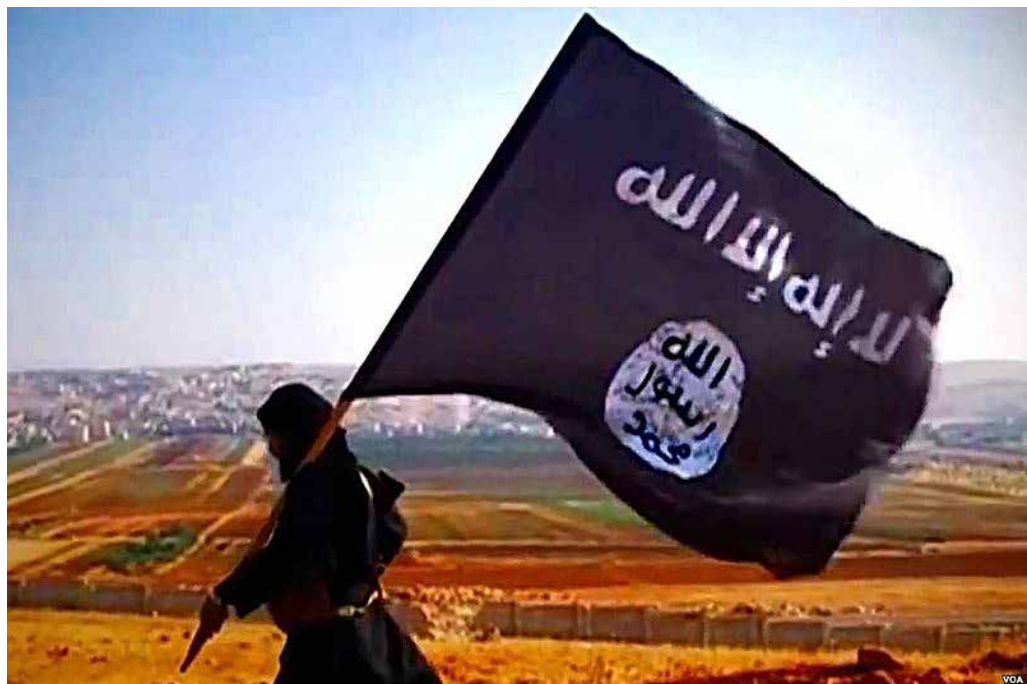
A member of ISIS with the flag of the Islamic State.

public is that the religion of Islam and its practice is separate from the exercise of the shariah legal system, economics, and governance. In reality, per the highest Islamic scholars and authorities, there is no differentiation.