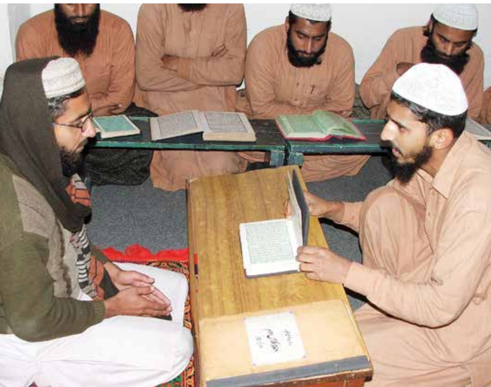
Convicted prisoners receiving Quranic education in Central Jail Faisalabad, Pakistan in 2010.