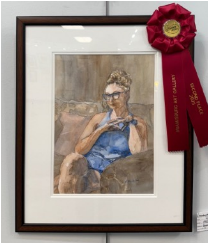
2 nd Place Water Media "Pensive" by Billie Dickson