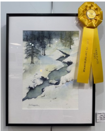
3 rd Place Water Media "Just Follow Me" by Carol Edsall