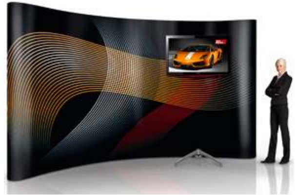
...may be integrated with Expand Popup Displays.