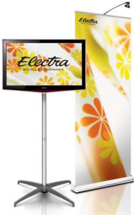
Can Stand alone or...