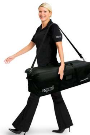
Ready to travel, weighs only 38 pounds

Increase the size of your digital presentation with this extra stable monitor holder. The Expand MonitorStand XL provides an easy way to mount your monitor and incorporate a video presentation, computer demonstration or moving graphics with traditional printed graphics. Our stable, portable monitor holder can hold an LCD/LED monitor up to 92.6 lbs. or a screen up to 60" (measured diagonally). Other than attaching the universal VESA brackets to the back of the monitor with a standard screwdriver, no tools are required to set up this stand.