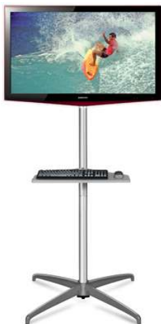
Optional Keyboard Shelf