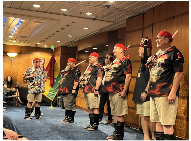
Top Left: Egypt, Top Right: CSSA, Bottom Left: Al Menah, Bottom Right: Abou Ben Adhem. 1st Place - Al Menah, 2nd Place - Egypt, 3rd Place - CSSA, 4th Place - Abou Ben Adhem.