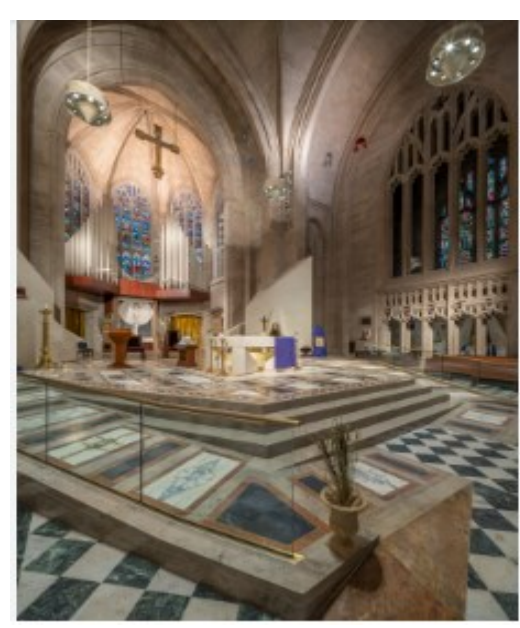
The Cathedral of the Most Blessed Sacrament