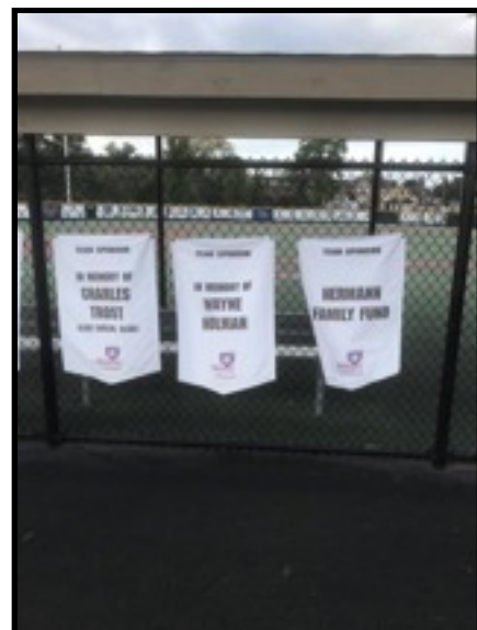
Example of Dugout Pennant