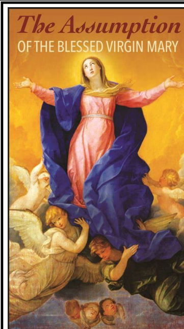
The Assumption OF THE BLESSED VIRGIN MARY