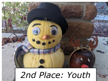
2nd Place: Youth