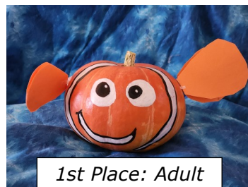
1st Place: Adult