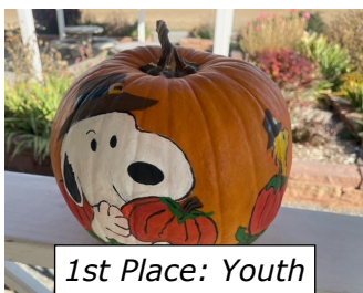
1st Place: Youth