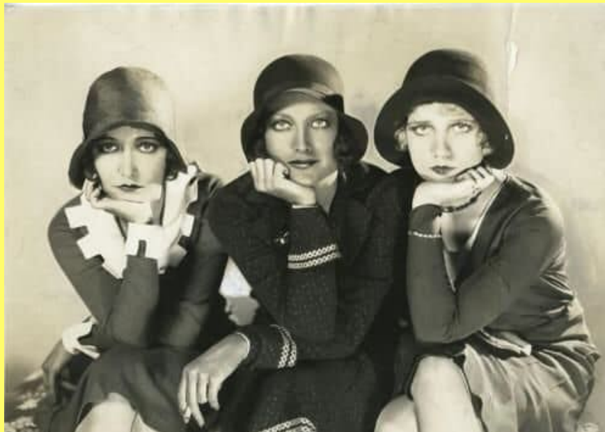
Film Stars: Dorothy Sebastian, Joan Crawford and Anita Page

Clinics from now on will be held at St. Michaels's Lutheran Church located at 1660 County Road B W, Roseville, Mn.