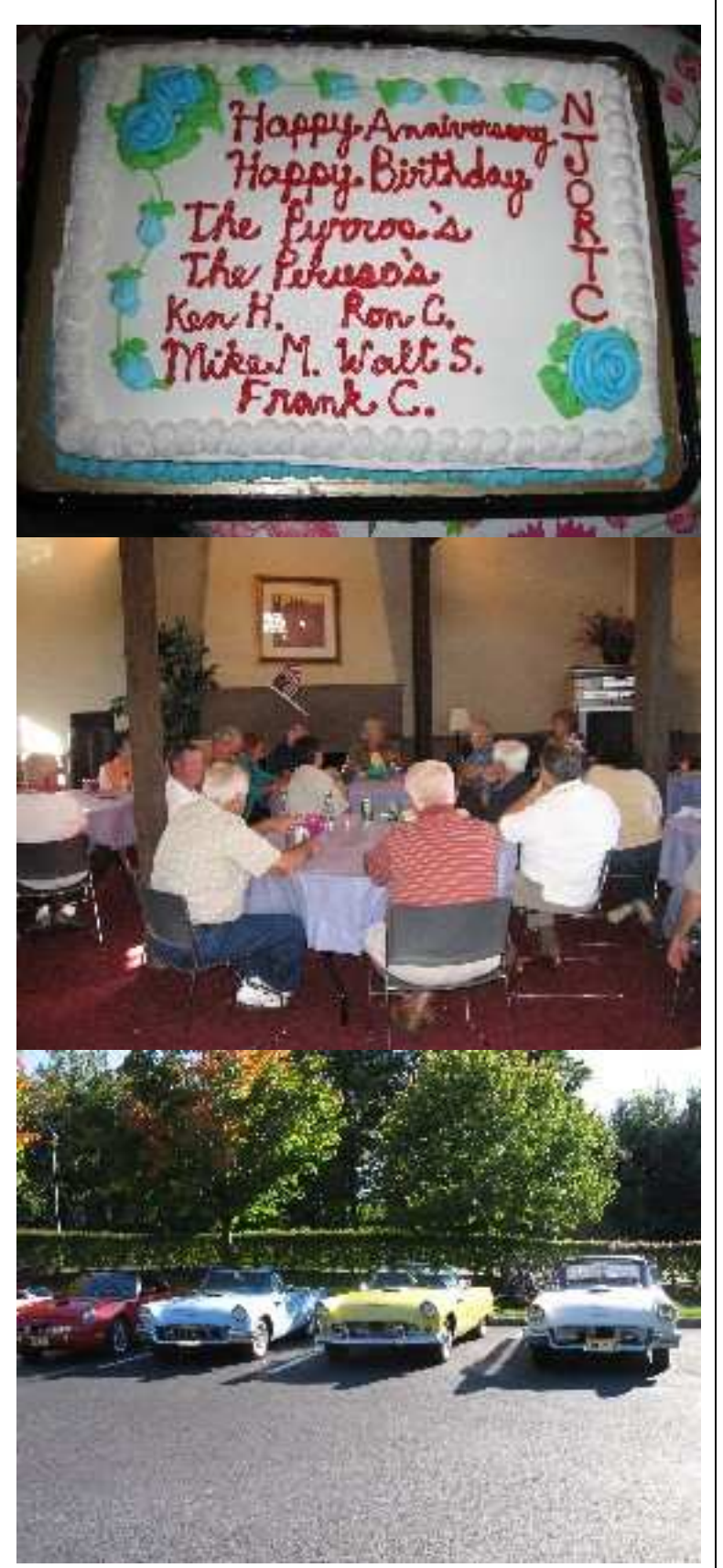
Some of the TBirds at the meeting