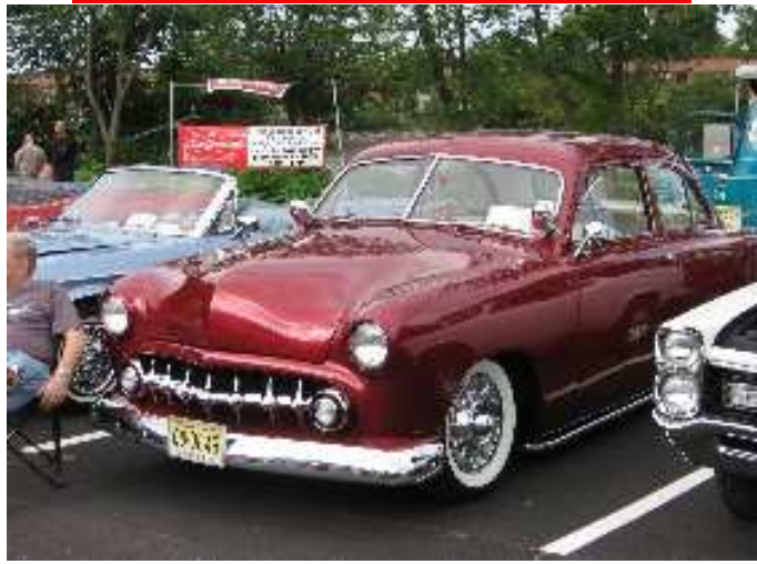
A nice custom 50 Ford