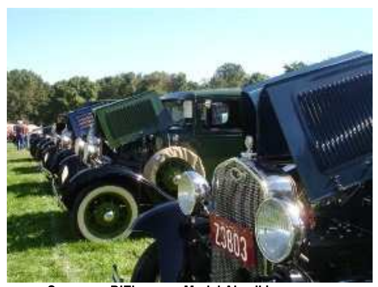
Concours D'Elegance-Model A's all in a row.