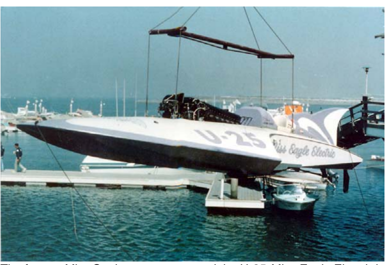
The former Miss Spokane now renamed the U-25 Miss Eagle Electric is launched at San Diego's Mission Bay.