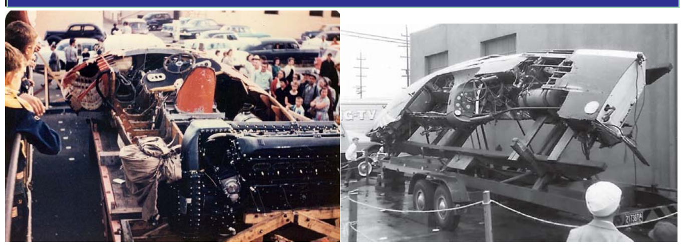
Above left; The wreck of the U-27 Slo-mo-shun IV and very large crowd. At right the U-60 Miss Thriftway wreck on tilt.