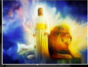
Yeshua ben Joseph and Yeshua ben David.

Astronomically speaking, there are 3 Constellations ruled by Leo in its complete. This final Picture of Prophecy and the Constellation 3:19 issue.