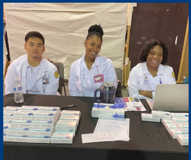
Coppin State University Nursing Students