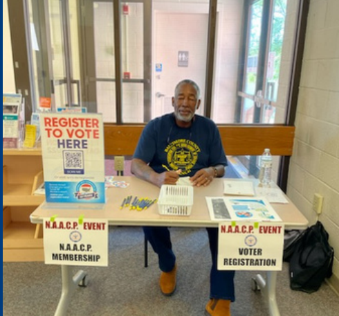
September 20 - Rosedale Library