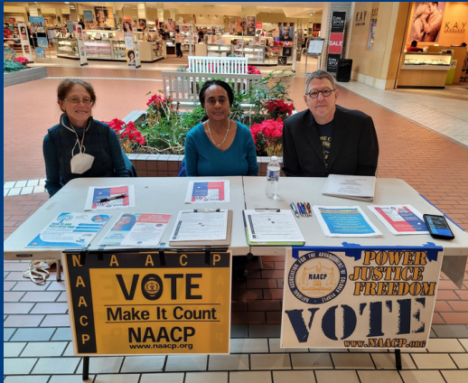
October 3 - Security Square Mall