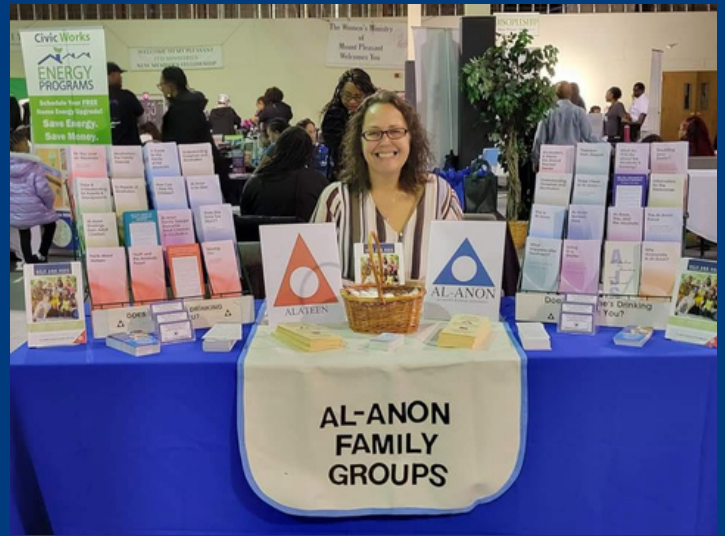
Al-Anon Family Groups