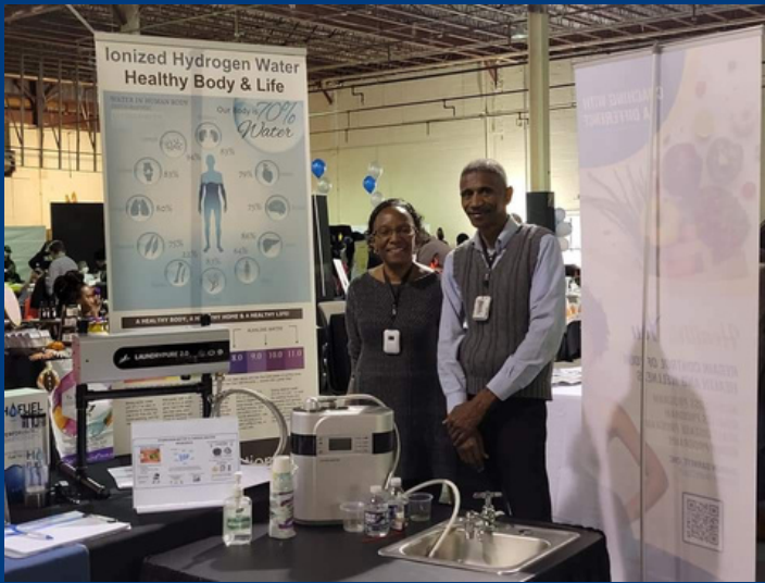
Ionized Hydrogen Water