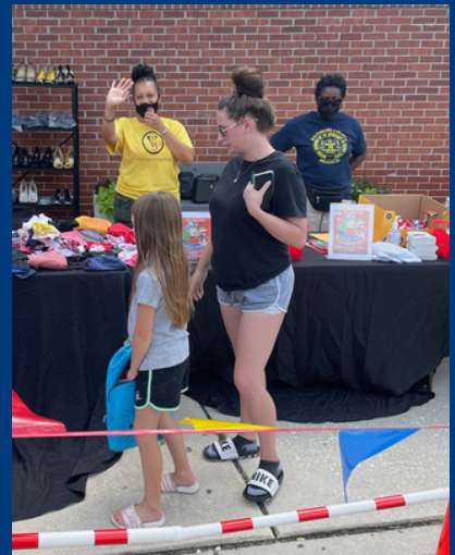
August 27 - Back to School Event at Victorious Living Faith Ministries