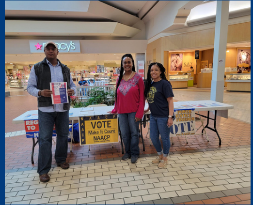
October 8 - Security Square Mall