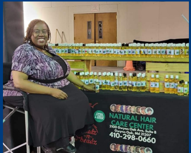
Natural Hair Care Center