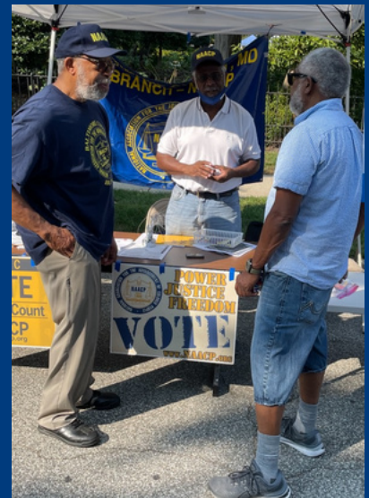
September 17- Baltimore County African American Festival