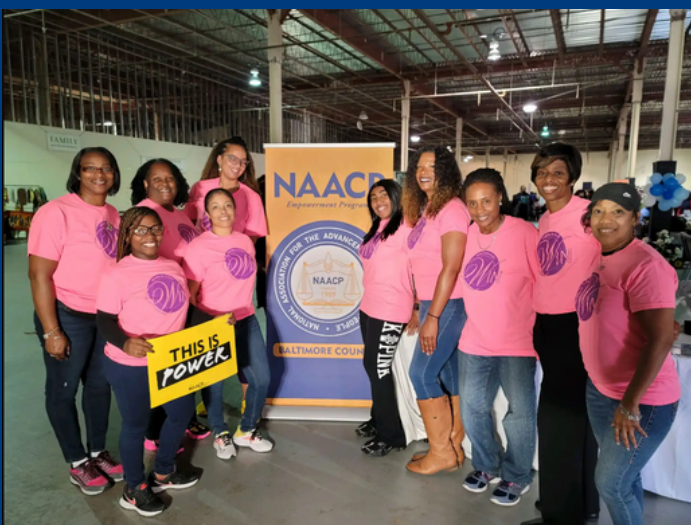
Women in NAACP