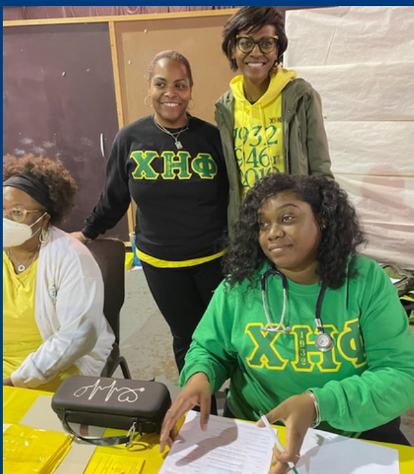
Chi Eta Phi Nursing Sorority