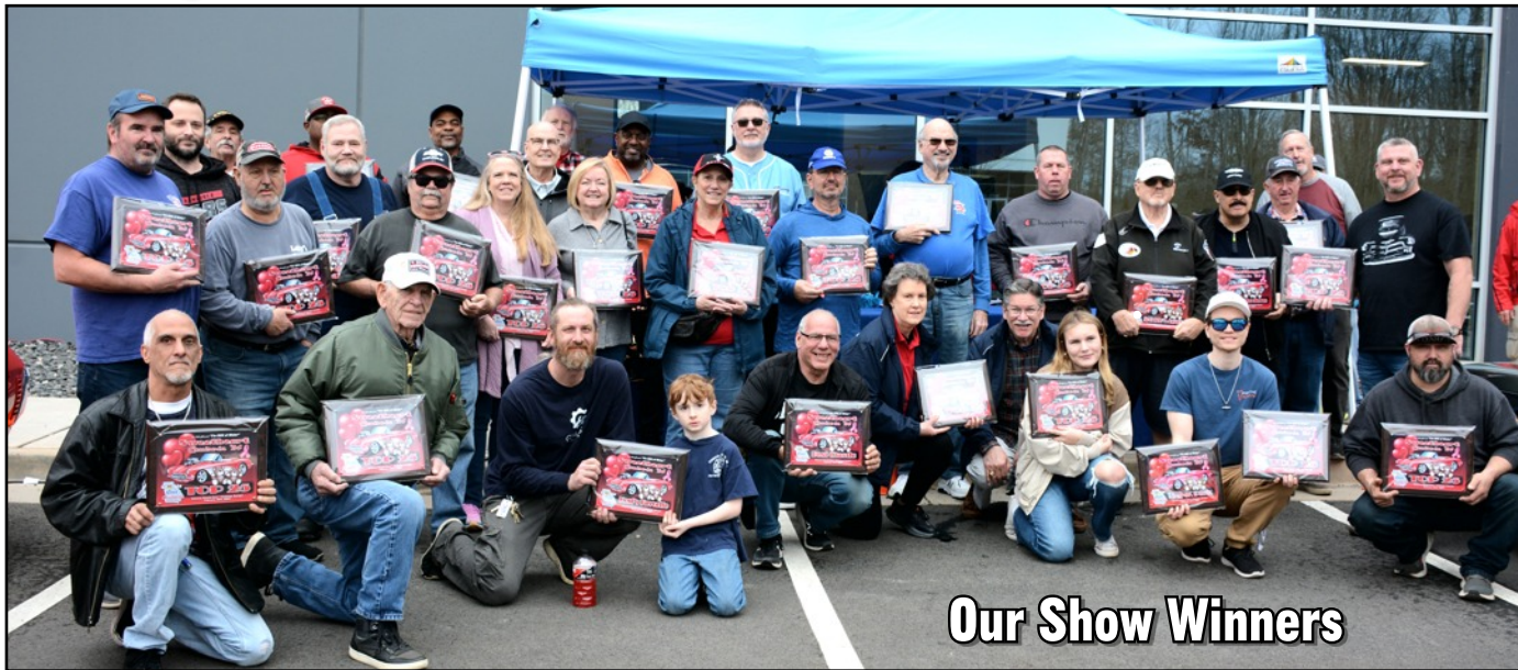
Our Show Winners