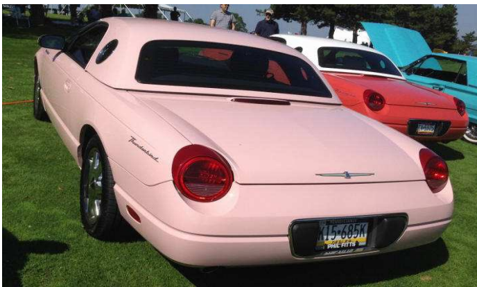
Seen at Pittsburgh - Companion for Pinky?