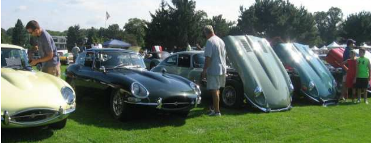
E-Jags - for Joe Saville-a lot more than just these