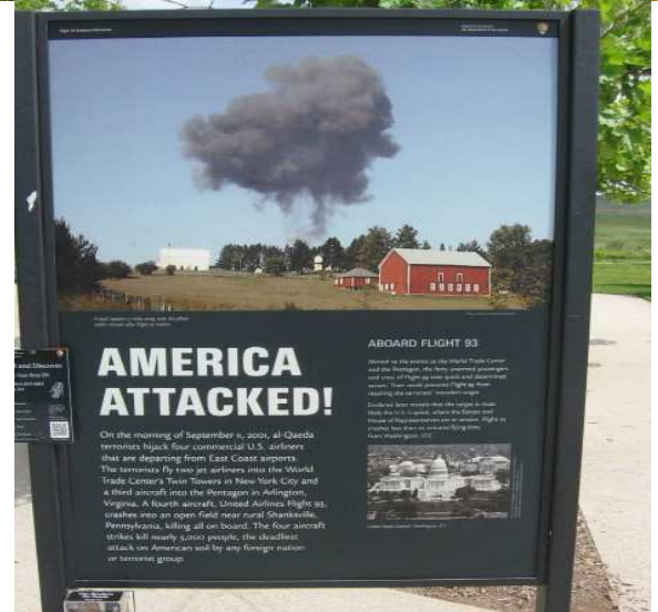
Story Board( 1 of 3) at Flight 93 Memorial