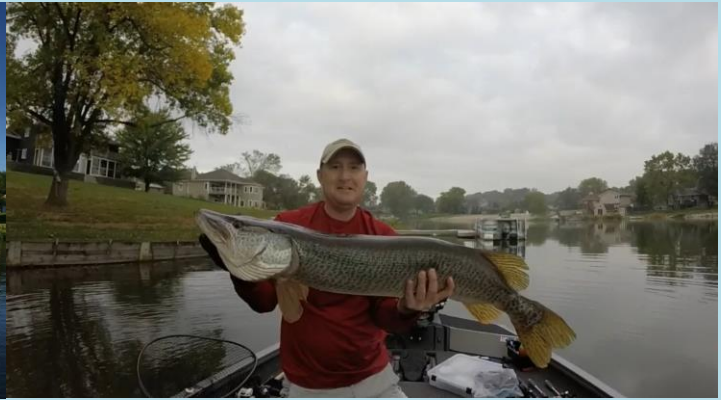
Tiger Musky from October 2021 (40 Inches)