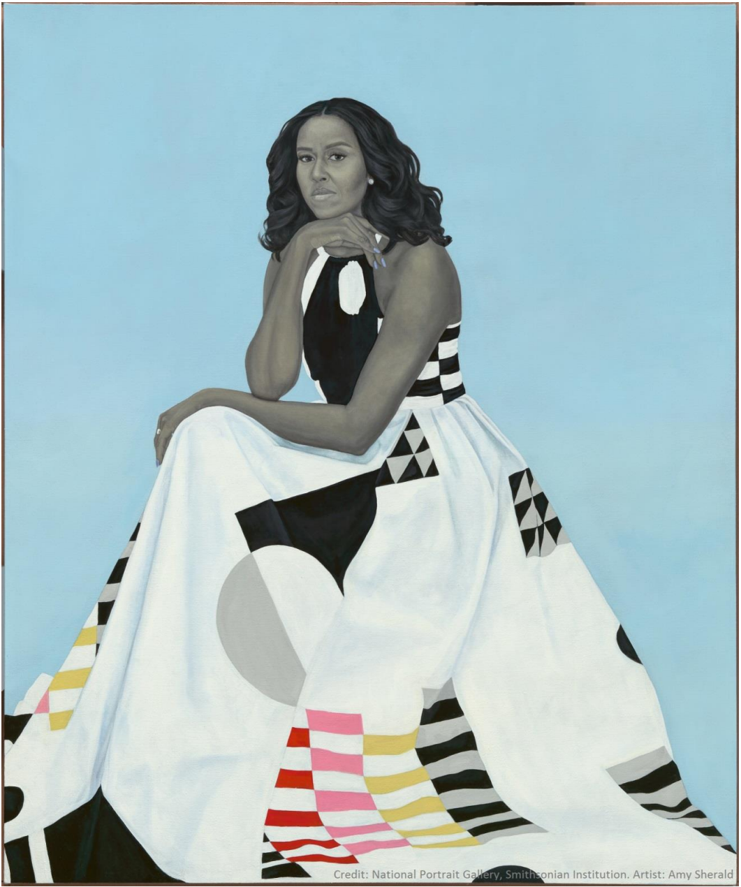
Artist: Amy Sherald

Test Your Knowledge of Herstory with this "First Ladies Challenge"