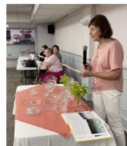
Such a lovely collection, thank you Ellen for sharing with us