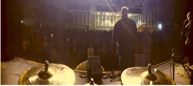
Fullenwider Auditorium Indio, CA

After the opening ceremonies the Flashback Boyz provided rock-n-roll from the 50's, 60's and more.