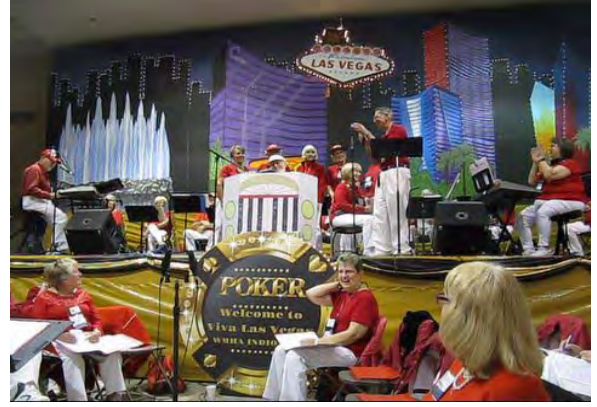
The Maestros performing in Indio