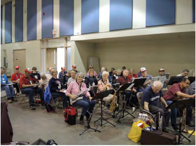
Look closely and you will see two of our favorite Maestros practicing for one of their awesome performances.

After the opening ceremonies the Flashback Boyz provided rock-n-roll from the 50's, 60's and more.