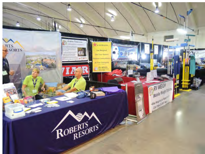
A few of the many commercial exhibits