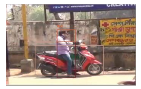
Figure 2. Edge detection