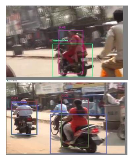
Figure 3. Single shot detector