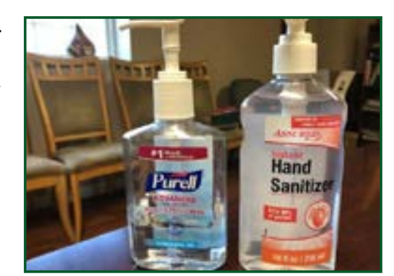
10 oz bottles of Hand Sanitizer

like and can order them online, just ship them directly to the camp at 5626 Laura Walker Rd. Waycross, Ga. 31503