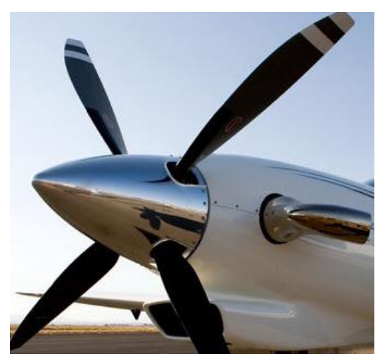
Is There a Turbo-Prop in the Future?

Other folks have figured out that if you need assistance and want to get flying earlier, then Arion Aircraft is a really good way to go.