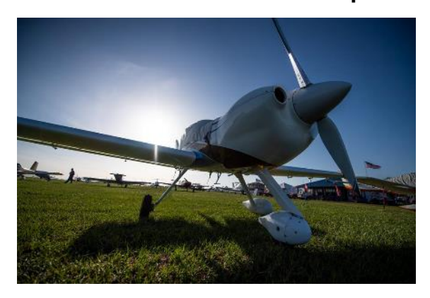
A Titan IO-340 Lightning on the Field