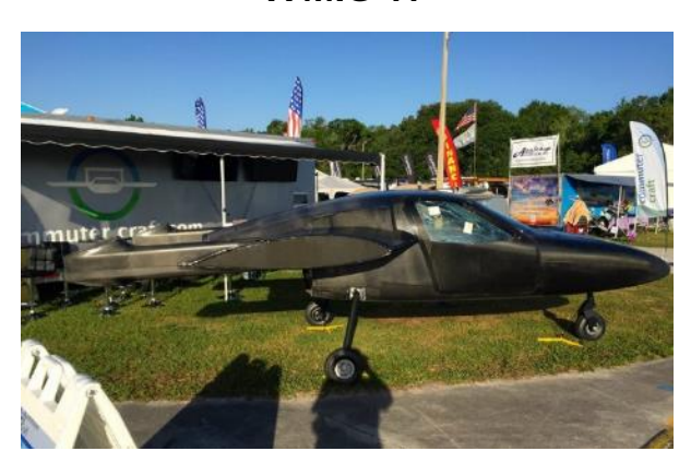
The Commuter Craft (All Carbon Fiber)