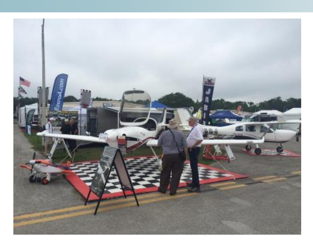
Buz Talking to Potential Customers