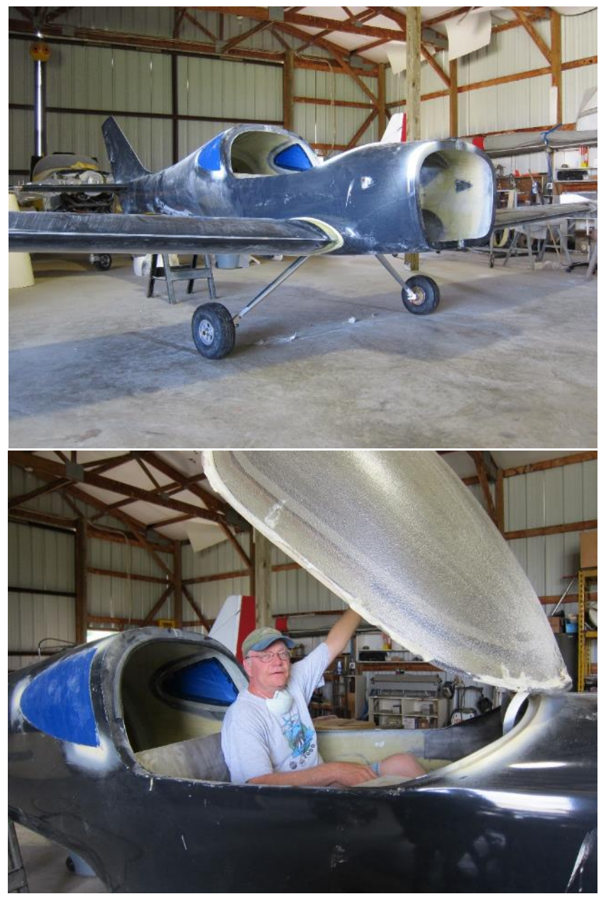
7 Years Ago, I Had My Jet on the Mains for the First Time

Russia and CIS, AVIA-NIANIA Ltd. Moscow, Russia, Phone: + 7495518-62-75, Mobile Phone: + 7925518-62-75, avianiania@mail.ru or avianiania@aol.com