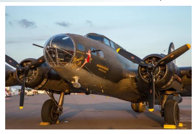
The Memphis Belle (Movie Plane)