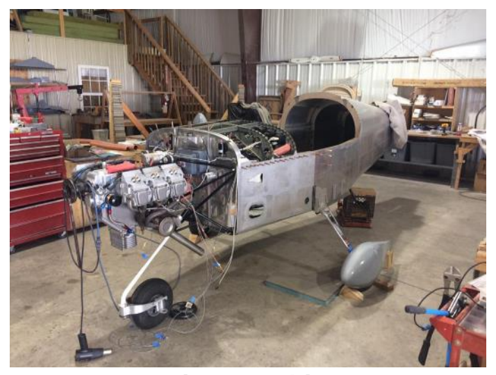
A Rand S19 Build Assist

Other folks have figured out that if you need assistance and want to get flying earlier, then Arion Aircraft is a really good way to go.