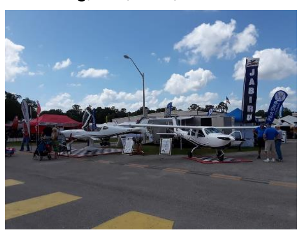
A Different View

Now for some pictures of Nick and Ben on their way to Sun-N-Fun. They had to dodge a little weather and fly in between some layers at one point, but they made it just fine.