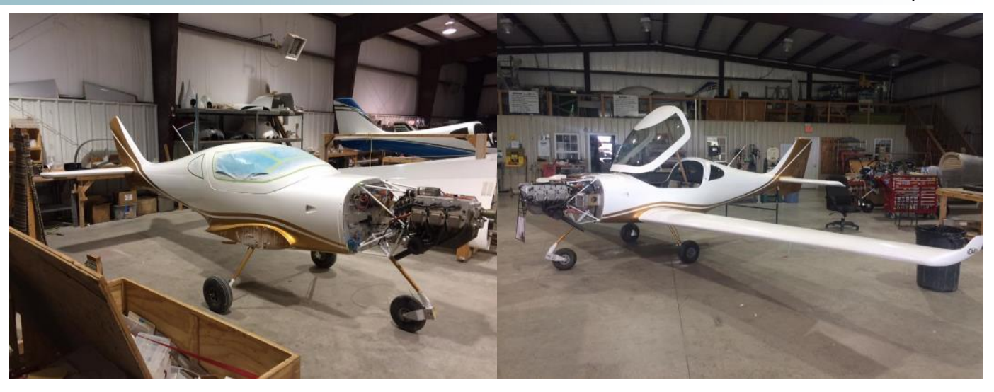
A Nice Lightning Refurb in the Shop After Paint