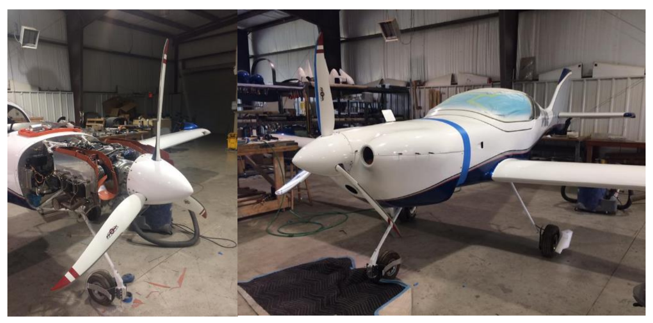
Almost Ready to Fly

The Canadian Lightning is looking really nice, a 3-blade prop and the canopy is installed. I can't wait to hear how it performs.