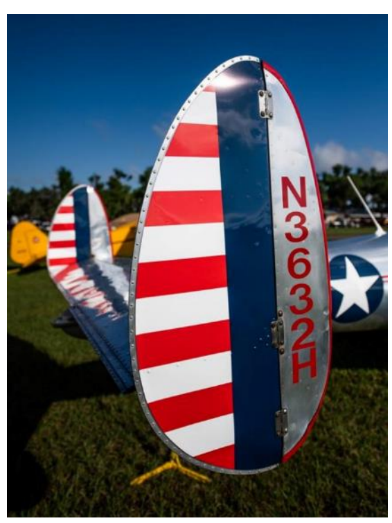
The Twin Tail on an Ercoupe