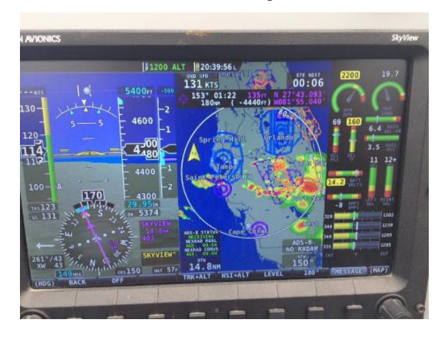
Some Weather on the ADS-B In Display