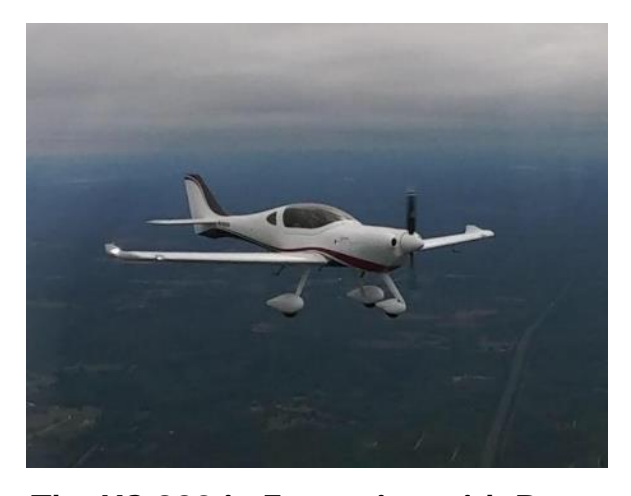
The XS 320 in Formation with Ben's Panther