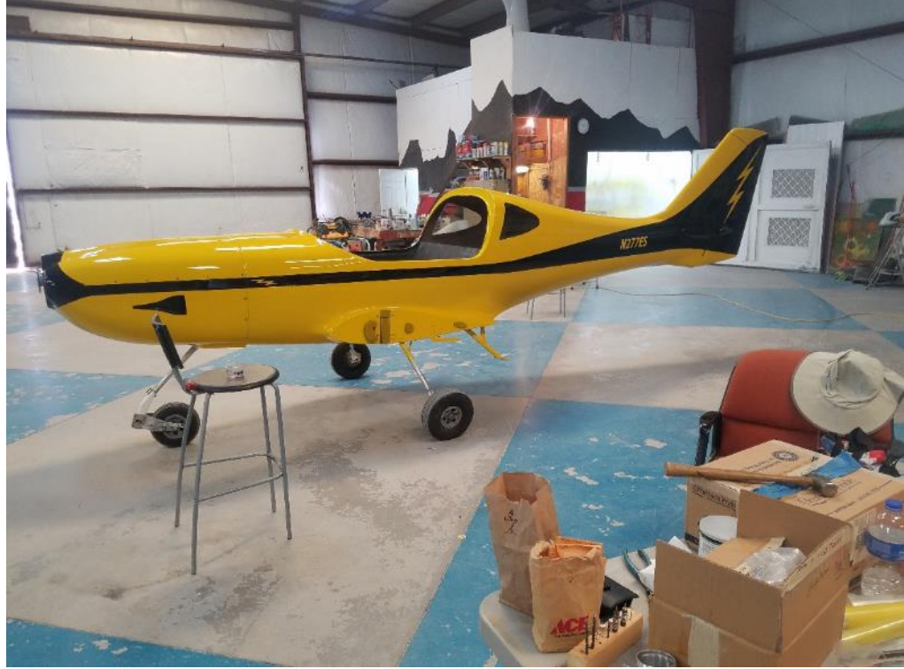
Jack's Jet Ready for its Wings