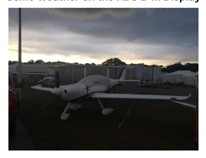
At the End of the Day

The next few pictures are just ones taken around the show. Always fun at Sun-N-Fun!