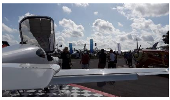
The Booth on a Nicer Day