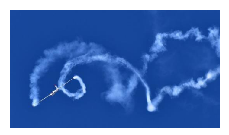
The Glider Show