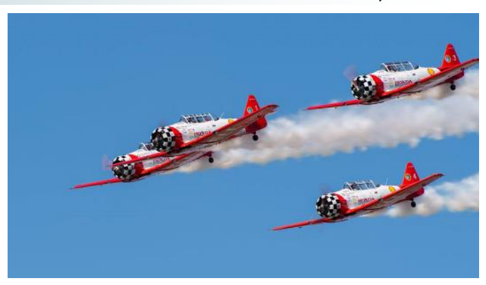
The Aeroshell Team

The next few pictures are just ones taken around the show. Always fun at Sun-N-Fun!