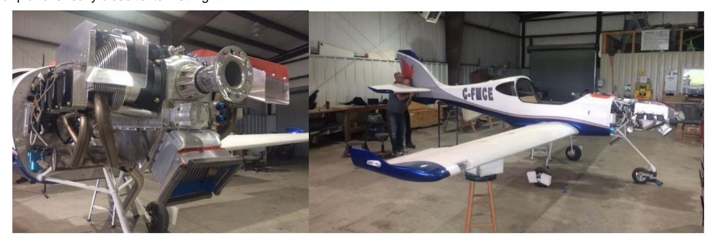
The Canadian UL520is Plane Gets its Wings

So, although things have changed a little, there is still many projects ongoing at Arion Aircraft. The UL520is powered airplane is really close to its first flight.