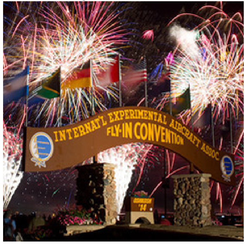
EAA AirVenture 2018 Airport Identifier - KOSH

AirVenture - Oshkosh, WI July 23 - 29, 2018