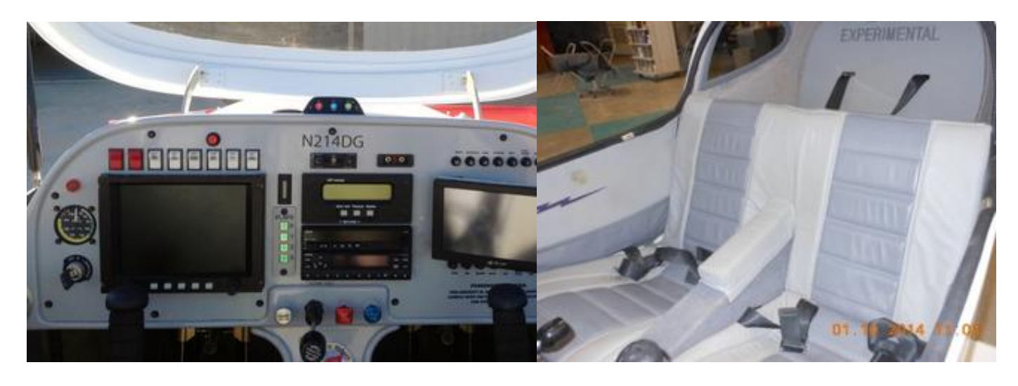
Contact Lightning West for details and more information. They also have a Jabiru aircraft for sale.