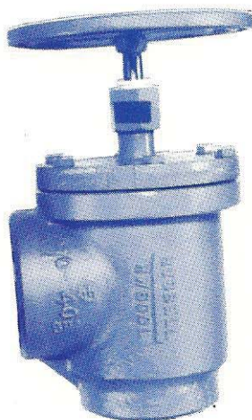
6" ANGLE VALVE SHOWN.

VALVE SIZES 5" THRU 14" ARE WELD-IN ONLY. "HUBBELL" IS CAST INTO VALVE BODY, AND ANY NUMBERS FOUND ON BODY CASTING ARE TO BE DISREGARDED. CATALOGUE NUMBERS ARE FOUND IN PACKING NUT AREA. COLOR: BLUE