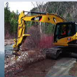
(Bottom): SKEr's innovative Expandable Stinger allows plants to go into the ground deeper, with more developed root systems, for high survival rates.