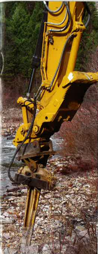
SKER's revolutionary Expandable Stinger and Rotary Stinger fundamentally affect the economics of revegetation. These machines are safer, faster, and more efficient than hand or auger planting, minimizing time on-site and reducing costs. An Expandable Stinger is shown above at Cedar Creek near Superior, Montana.

TerraEchos, Inc. , a subsidiary of S&K Technologies, Inc., is a Montana-based, Tribally owned company providing Adelos® S4, a leading covert intelligence and surveillance sensor knowledge system for protecting high-value critical infrastructure, monitoring sensitive perimeters, and securing vulnerable borders.