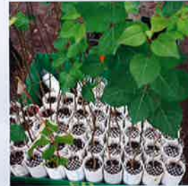
Cover photo: Staging area for planting at the Milltown Dam site. Specialized containers for propagation and transportation minimize handling.

S&K Technologies, Inc., directly benefits our shareholders, the over 7,000 CSKT Tribal members. We give back to our community through employment opportunities, generous annual dividends, educational scholarships, and collaboration with various Tribal cultural, educational, and business leaders throughout the reservation.