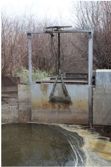
Headgate looking downstream