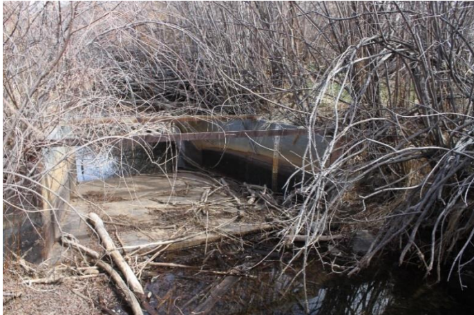
Flume looking downstream