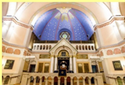
(Pestalozzistrasse Synagogue—Berlin, Germany)