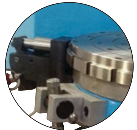
24 Index Manual Shot Pin Option