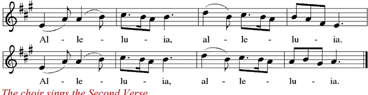
The choir sings the Second Verse.