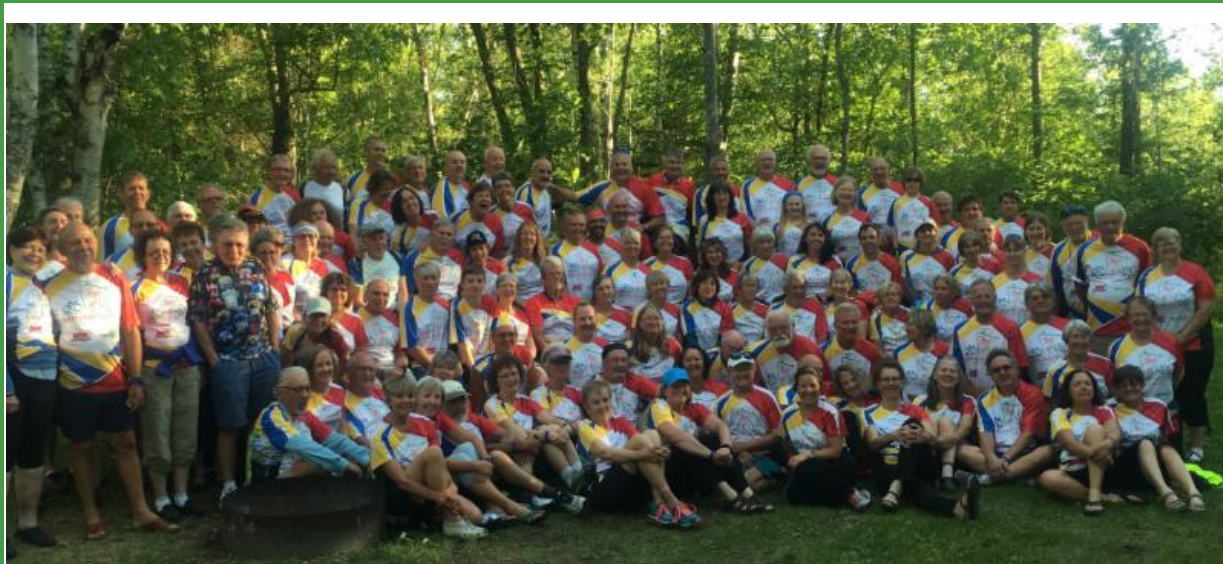
2016 Group Shot at Itasca State Park