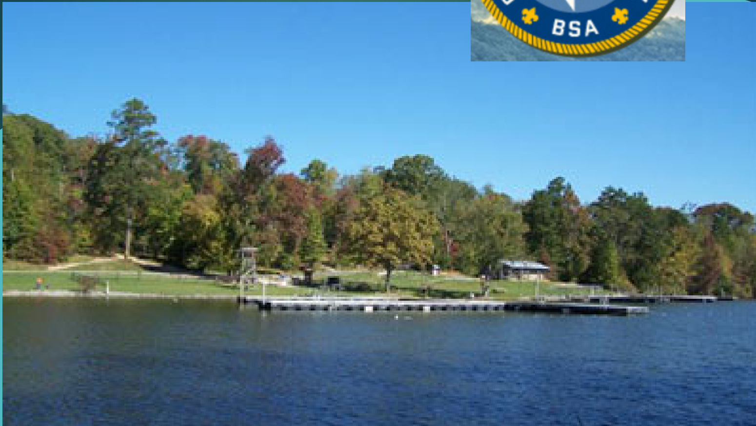
Watts Bar Lake