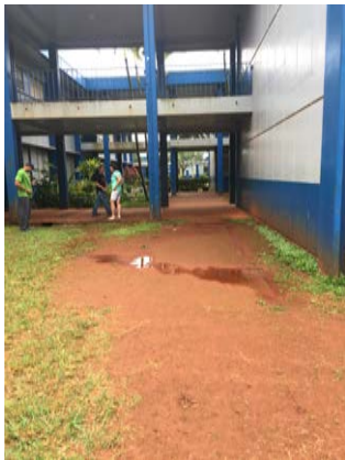
Before: Red clay dirt/mud at entrance

location Wheeler Army Air Field, Wahiawa, Hawaii