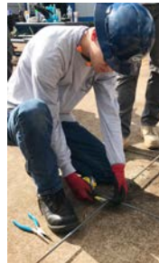
Measuring & cutting reinforcing