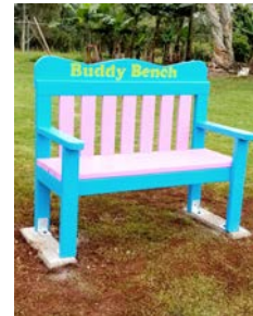
“Buddy bench” installed