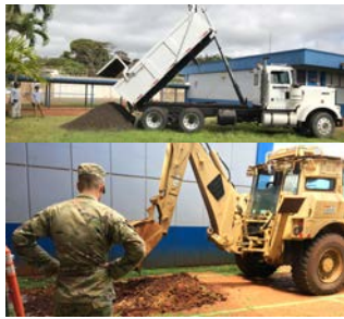
Top & Bottom: Managing heavy equipment work