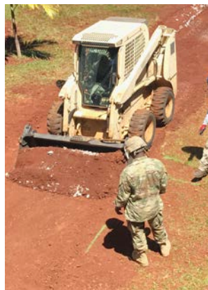
In Progress: Site preparation