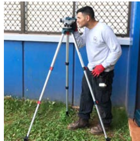
Project planning: site surveying