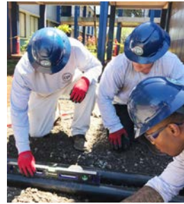
Placing pipe to be embedded in concrete