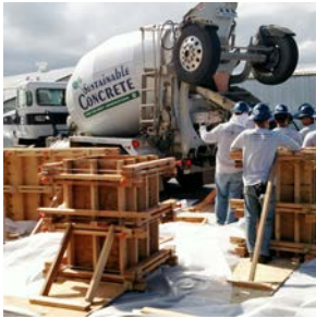
Pre-project formwork and ready-mix concrete training