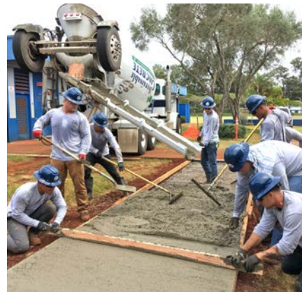
In Progress: Placing concrete