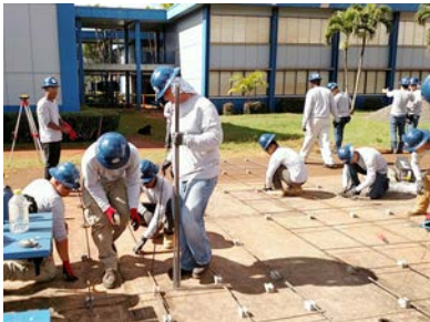
Reinforcing steel placement