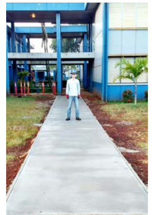
After: Completed project