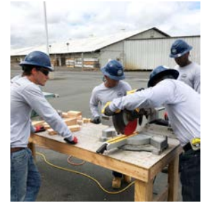
Building custom formwork