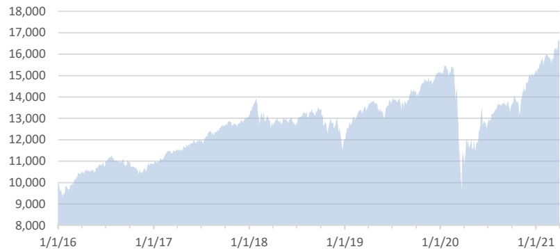
Hypothetical Growth of $10,000 from inception