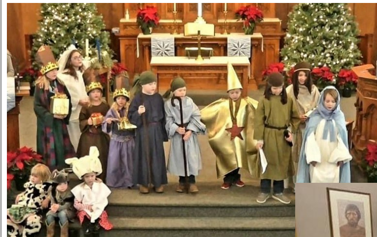
Children's Christmas Program