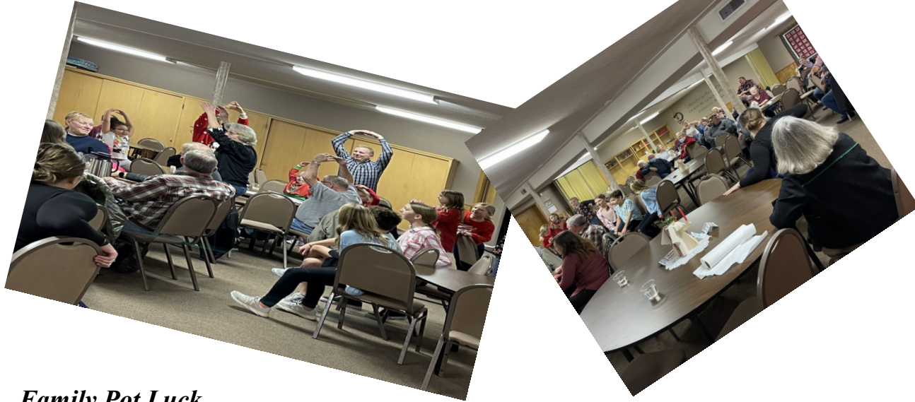
Family Pot Luck