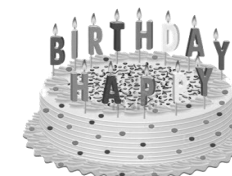
Hope Family January Birthdays