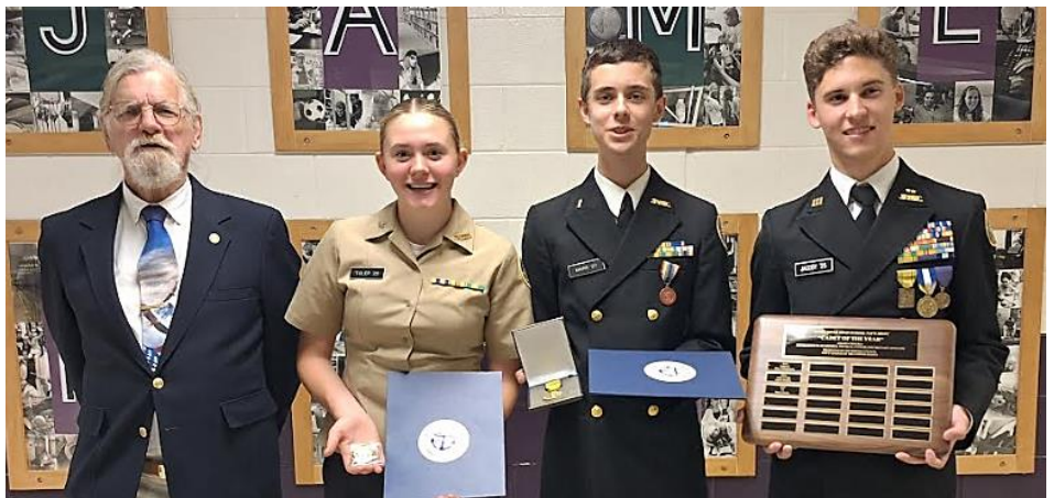
James River High School NJROTC