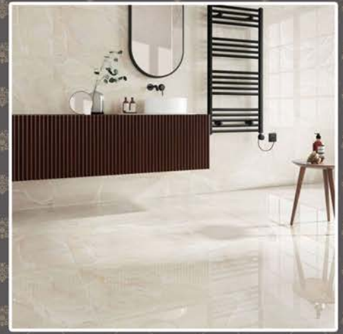
Premium Tile Flooring