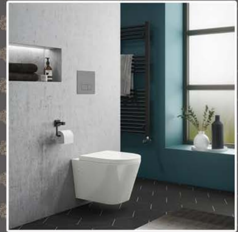
Wall mounted Closets