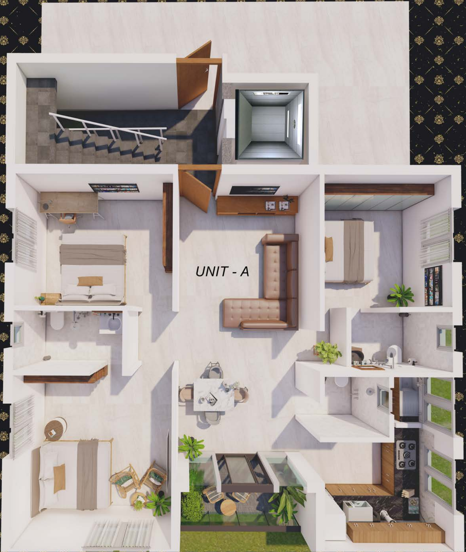
UNIT - A - INTERIOR VIEW