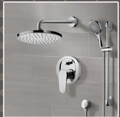
Grohe / Jaquar Fittings

Additional features: Three Phase EB connection, Metro water connection