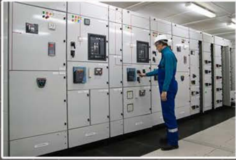
24 Hours DG Backup