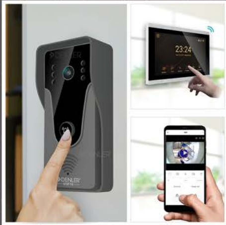
Video Door Phones