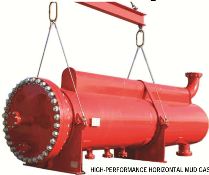
HIGH-PERFORMANCE HORIZONTAL MUD GAS SEPARATORS AND FLOWLINE DEGASSERS

Hampco's proprietary high performance horizontal mud gas separators have been in the field for many years. The superior separating capacity of the horizontal design is now becoming much more recognized in the industry as greater gas handling capacity is required. The same design of units are now also supplied as flowline degassers for the specific purpose of handling riser gas.