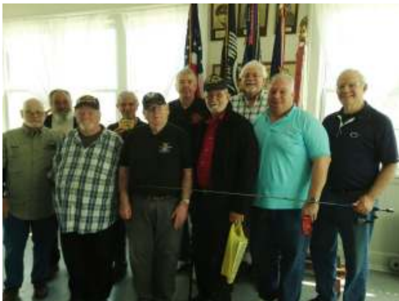
Prize winners at the April, Flounder Fishing workshop.