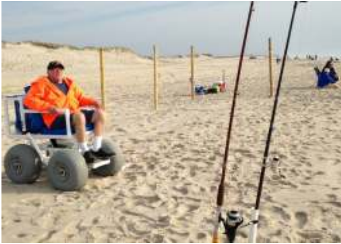
Vietnam Veteran fishing in one of the new beach wheelchairs at the Island Beach State Park