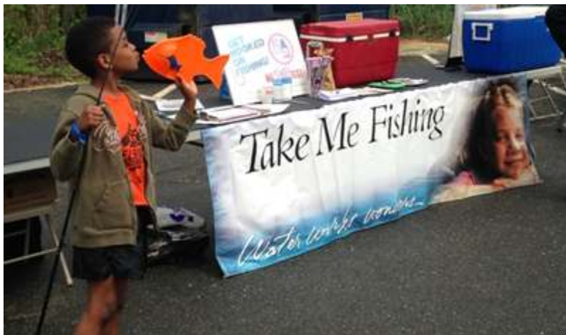
Armed Forces Day Cast a Line of Caring for Veterans