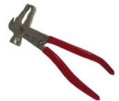
Weight Hammer 301400425