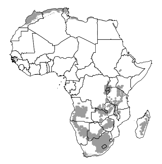
Figure B.1: African Territory Suitable for Large-Scale European Settlement

Three main considerations motivate why this is a reasonable instrument for studying the effects of colonial liberation regimes. First, all components of the instrument are exogenous in the sense that they are not caused by political factors that could affect regime durability. Importantly, the tsetse fly data comes from Alsan's (2015) tsetse fly suitability index—which is derived from historical climate data—rather than from colonial or post-colonial maps of tsetse fly prevalence, which may be affected by climate change or by stronger states better able to control the fly (389). We also estimate models with various pre-independence covariates (logged population density in 1800, whether any ethnic groups in the country had a precolonial state, index of rugged terrain, colonizer fixed effects) to account for additional sources of heterogeneity. We use these rather than the more standard (relative to the literature) set of covariates used in Table 3, which are mostly post-independence and therefore inappropriate "post-treatment" controls relative to our instrument. Of course, factors such as historical population density might have also been influenced by the instrument, which is why we also estimate specifications without the covariates.