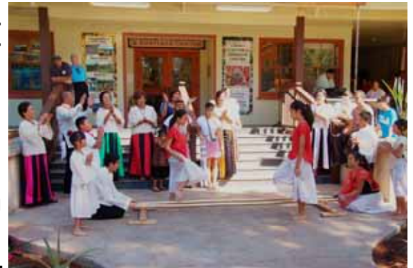
Members of Lāna‘i’s Filipino Community shared folk dances and music, and celebrated more than 80 years of contributions to Lāna‘i’s history.