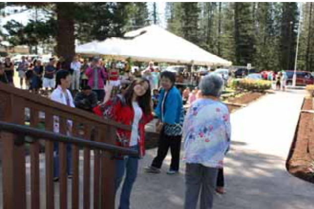
Ladies of the Lāna‘i Hongwanji Mission shared an old Japanese folk dance and mochi rice treats with the audience as a part of the opening events.

Another challenge is funding. If we are to ensure that the history of Lāna‘i’s families will be remembered and passed on, we need to be able to fund operation of the Lāna‘i CHC—including staff support, utilities, and continued development of the archival collections and exhibits. In these days of challenging economic issues, it is difficult to think about supporting efforts like the Lāna‘i CHC heritage programs. But, if we on Lāna‘i do not care for, and honor our past, it will be lost. There are many uncertainties about the future, but one thing that we can be certain of is that knowing our past and celebrating our heritage, will enrich all our lives. Furthermore, caring for our heritage is good for business. What we have on Lāna‘i is found no where else, and every day, we hear from people who value the unique place which we call home—your history attracts people to Lāna‘i.