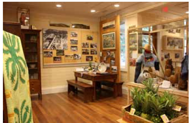
Plantation Heritage Room at the new Lāna‘i CHC.

The Lāna‘i CHC organized as a community non-profit foundation in 2007. In 2009, 5,029 residents and visitors participated in programs of the center. Programs included work with Lāna‘i students; service projects with island residents, visitors and national education/resource